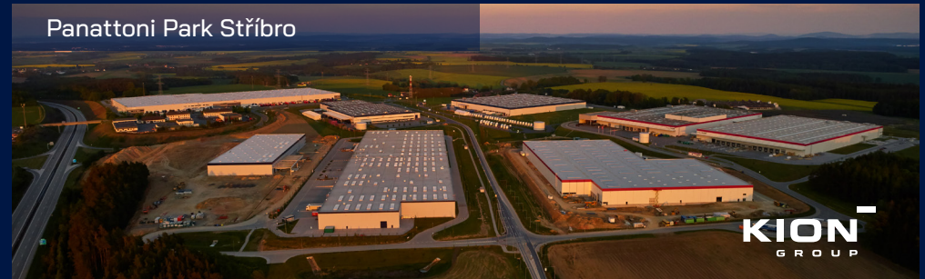
Panattoni Park Stříbro

Location: Ostrov u Stříbra, Pilsen Region