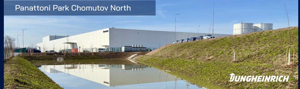
Panattoni Park Chomutov North