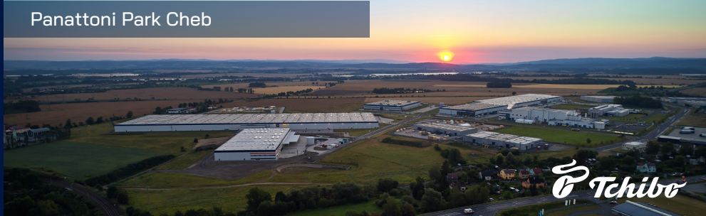
Panattoni Park Cheb